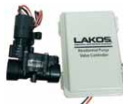
AutoPurge with battery-operated diaphragm valve