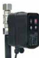
AutoPurge with motorized ball valve