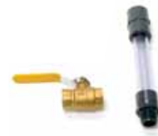
Manual & Visual Purge Options